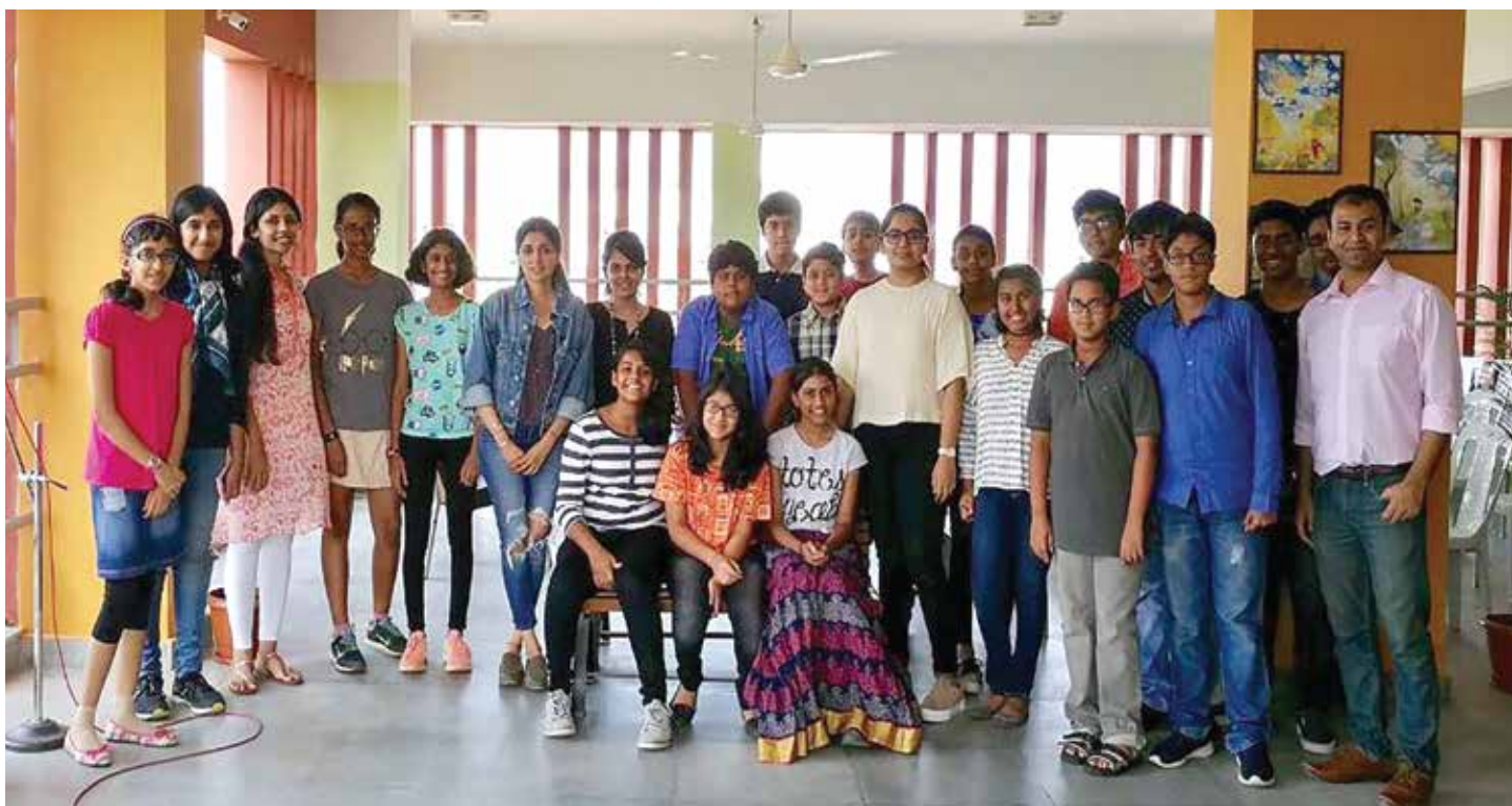
Hyderabad class of 2017-18