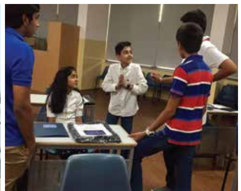
Class 1 Icebreakers