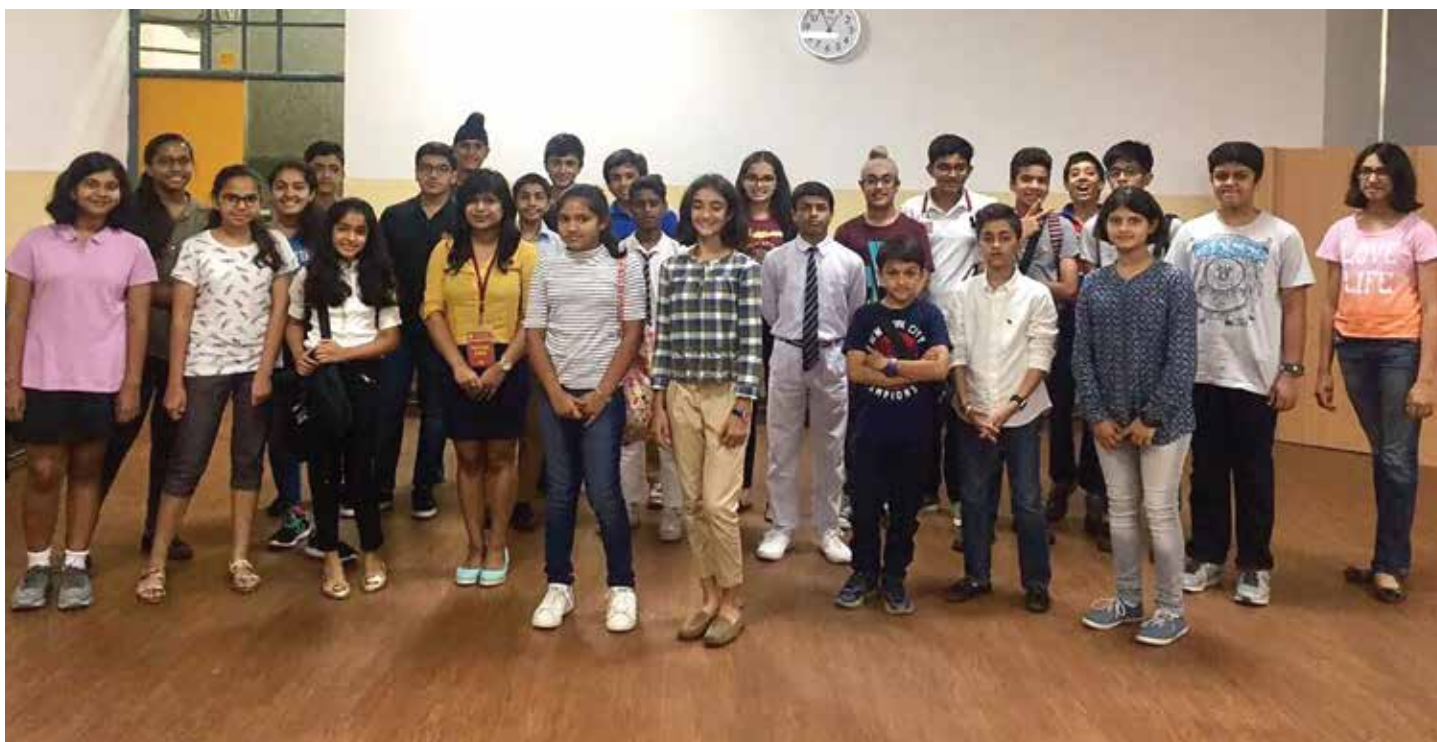
Delhi class of 2017-18